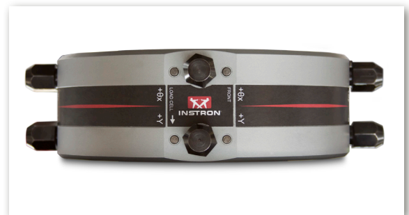
AlignPRO Alignment Fixture