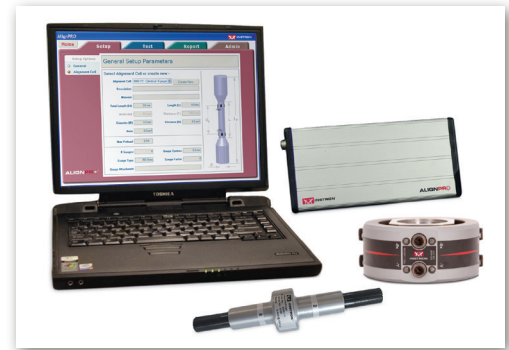
AlignPRO Alignment system

Custom alignment cell definitions can be created and stored in a local specimen database. The software also features a comprehensive reporting tool.